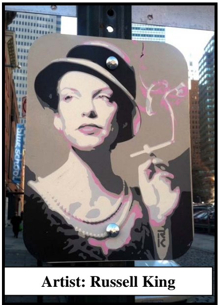
Artist: Russell King